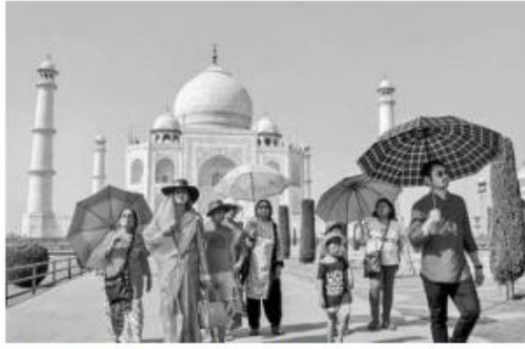
Scorching heat: Tourists using umbrellas to shield themselves from the sun, during their visit to the Taj Mahal, in Agra.

Temperatures in March were higher than normal, particularly in Gujarat, Rajasthan and several parts of northern India. Multiple heatwaves were reported this month.