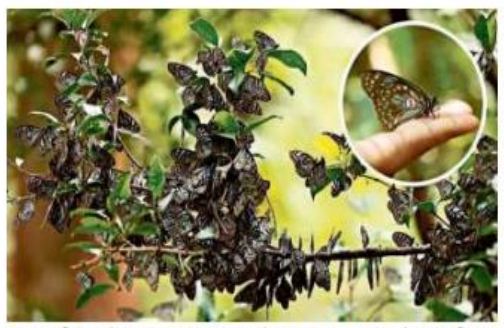
Butterfly enthusiasts in Wayanad tagging Danaine butterflies to track their migratory movement.

Every year, millions of Danaine butterflies undertake the journey. Six species of milkweed butterflies have been found in the migratory swarms. It is believed that they fly from the Western Ghats to the Eastern Ghats