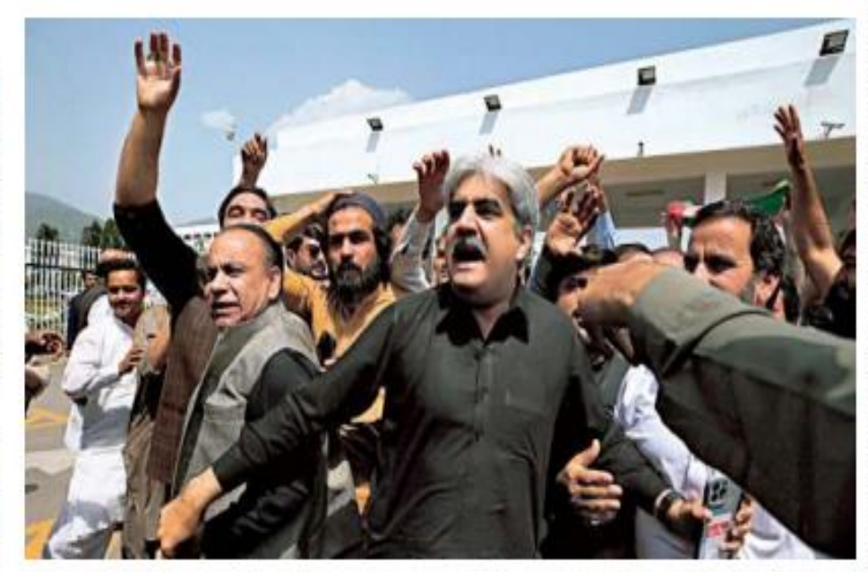
New turn: Supporters of the Pakistan Tehreek-e-Insaf party raising slogans in favour of Prime Minister Imran Khan, outside the National Assembly in Islamabad on Sunday.

Chief Justice Bandial observed that public order must be maintained and no state functionary shall take any "extra-constitutional" steps in the prevailing political situation, adding that all