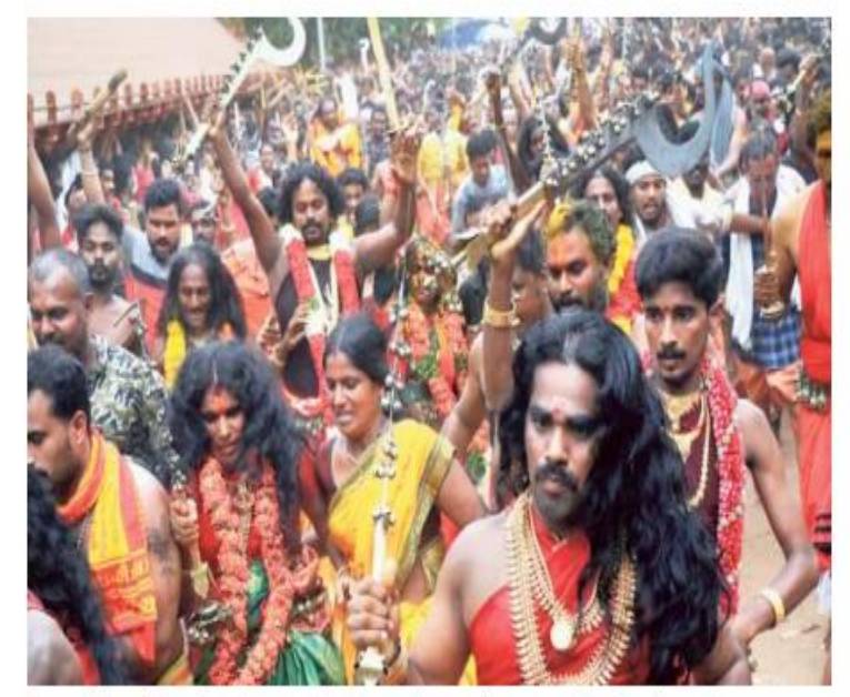
Unconditional devotion: Devotees led by oracles moving around the Sree Kurumba Bhagavathy temple at Kodungalloor during the Kavutheendal ritual in connection with the annual Bharani festival on Sunday.

The temple premises turned into a sea of red as men and women, in red robes, from across the State thronged the temple. Brandishing traditional swords adorned with tiny bells, the flurry of oracles in a trance stormed the temple creating a delirious ambiance. They smote their heads with swords, proclaiming their devotion to the Goddess. Blood could be seen dripping from their foreheads smeared with sandalwood and turmeric paste. While the oracles ran around the temple in the depths of trance, devotees struck the temple rafters