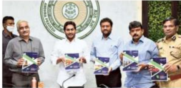
Chief Minister Y.S. Jagan Mohan Reddy releasing a District Handbook of Statistics on Monday.

"The performance of all Collectors will be assessed on that basis and the same