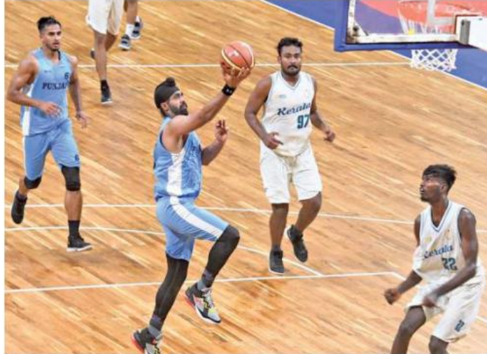
Dominant show: Punjab proved too good for Kerala. •R. RAGU

Immediately, Punjab took a time-out and from that point never looked back as Amjyot Singh and