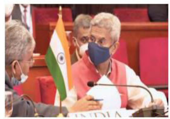
S. Jaishankar at the Bay of Bengal Initiative for Multi-Sectoral Technical and Economic Cooperation meeting in Colombo

Addressing the ministerial of the BIMSTEC (Bay of Bengal Initiative for Multi-Sectoral Technical and Economic Cooperation), he urged closer cooperation and connectivity among the members. The BIMSTEC summit scheduled for Wednesday has drawn global attention because of participation from Myanmar which was isolated internationally following the