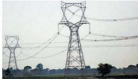
Demand went up due to heatwave in the State. •FILE PHOTO

“The State is facing a heatwave leading to manifold increase in power consumption. The supply of coal is inadequate. With the lifting of all COVID-19 related restrictions, all businesses and commercial establishments too have begun work in full