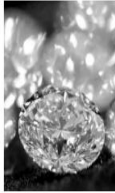
Alrosa supplies 90% of Russia's rough diamonds.

Alrosa, which has been recognised as a state-owned entity (SOE) by the U.S. Department of the Treasury, was targeted by the U.S. authorities during the beginning of the conflict in Ukraine. The Department of the Treasury described Alrosa as the "world's largest dia-