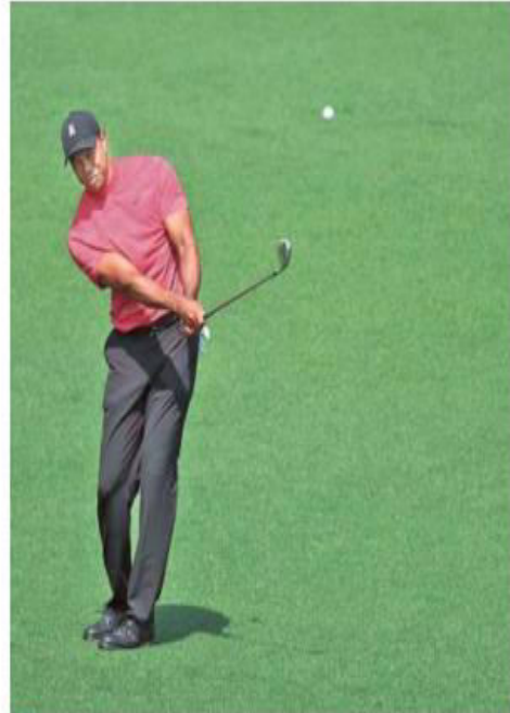
'Not easy': Woods, who was tied 10th, said the challenge would be negotiating the course with his surgically repaired leg.

Top scores: Im Sung-Jae (67); Cameron Smith (68); Dustin Johnson, Scottie Scheffler, Danny Willett and Joaquin Niemann (all 69); Corey Conners, Jason Kokrak and Patrick Cantlay (all 70); Matthew Fitzpatrick, Tiger Woods, Kevin Na, Webb Simpson, Tony Finau, Harold Varner III, Daniel Berger, Will Zalatoris and Harry Higgs (all 71).