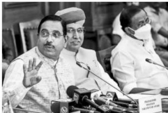
One-time offer: Union Minister Prahlad Joshi briefing the media, in New Delhi on Thursday.

"This may release several coal mines which the present government PSU allottees are not in a position to develop or are disinterested and could be auctioned as per the present auction policy. Three months' time will