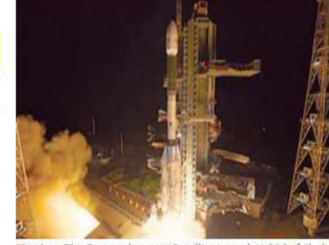
Fixed up: The Geosynchronous Satellite Launch Vehicle failed to inject into the orbit on August 12, 2021.

A senior official of the Vikram Sarabhai Space Centre