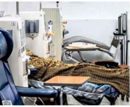
Healthy systems: The medical devices industry requires a standard operating procedure with transparency.

hopeful that this would translate into more credible healthcare delivery as well as restrain the fly-by-night operators who posed a great risk to patients and the reputation of the industry.