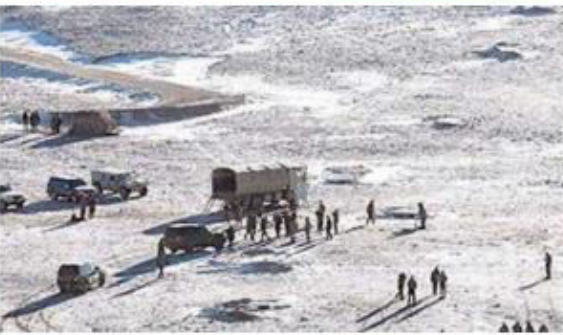
Border moves: PLA personnel and tanks during the disengagement along the LAC in Ladakh.

"It is learnt that flight sorties are being coordinated from a unified command centre and are extensively monitored for further improvement. Efforts are being made to cover all important locations, places in the UAV net for better patrolling and other related activities," said an official source citing inputs.