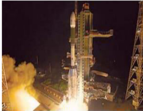
Fixed up: The Geosynchronous Satellite Launch Vehicle failed to inject into the orbit on August 12, 2021.

A senior official of the Vikram Sarabhai Space Centre