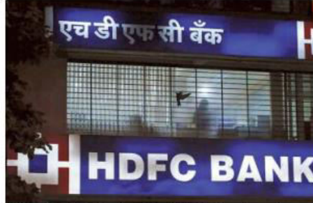
Adding heft: HDFC Bank said it added 734 branches and 21,486 employees during the year.

Total income on a standalone basis rose by more than 8% to ₹41,085.78 crore in the January-March period, from