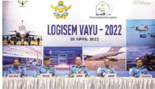
IAF chief V.R. Chaudhari with senior officers during the logistics seminar in New Delhi on Thursday.

“In order to standardise logistical functions and provide a blueprint for the fu-