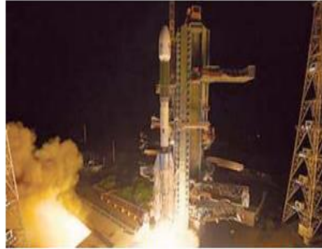
Fixed up: The Geosynchronous Satellite Launch Vehicle failed to inject into the orbit on August 12, 2021.

A senior official of the Vikram Sarabhai Space Centre