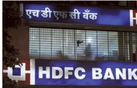
Adding heft: HDFC Bank said it added 734 branches and 21,486 employees during the year.

Total income on a standalone basis rose by more than 8% to ₹41,085.78 crore in the January-March period, from